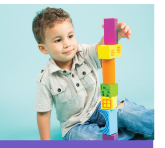
At Age 3 Years: Cognitive Development • Builds towers of more than 6 blocks