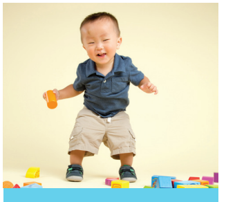
At Age 18 Months: Physical Development • Walks alone