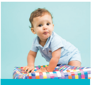
At Age 9 Months: Physical Development • Crawls

Can you spot the signs of on-track development in your child? Here are just a few to look for. Find more at www.exceed.ri.gov